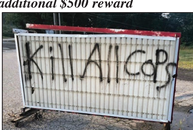
Someone spray-painted "Kill All Cops" and similar messages on surfaces along US 76 between Sunnyside Road and Papa's Pizza To Go over the weekend.

Investigators believe the messages were scrawled sometime overnight between July 4 and July 5. The perpetrator's efforts were short-